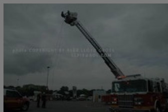
Tactics used by the Fire Department are demonstrated.